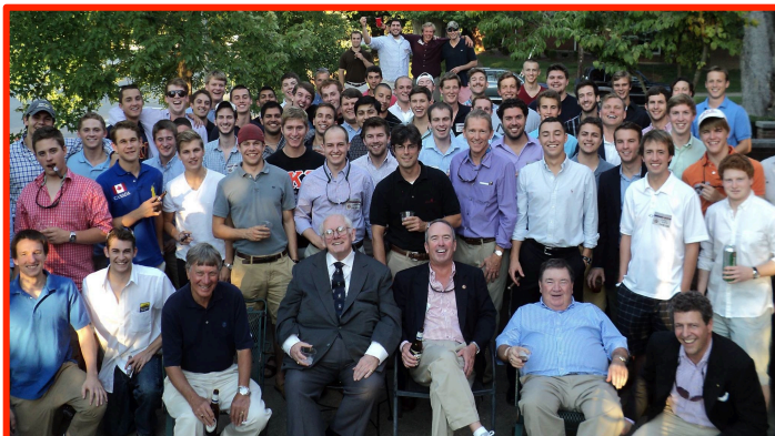
The summit gathers for a picture after a smoker with custom DKE cigars

The Summit would not have been possible without all the support from our alumni. If we missed their support, the chapter would not have had this amazing opportunity.