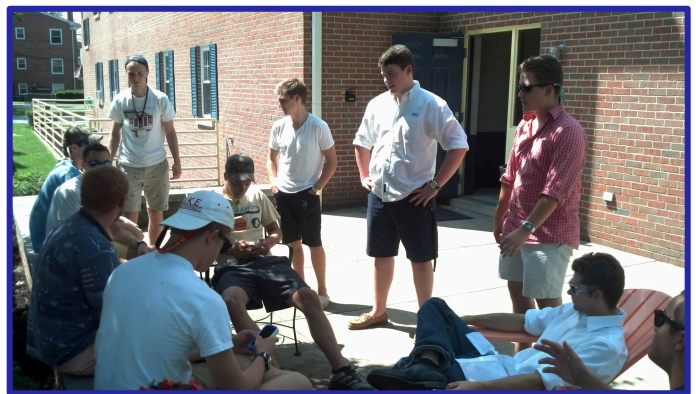
Brothers from different chapters meet for the first time, telling stories of different traditions

The Kappa chapter hosted the first inaugural Delta Kappa Epsilon International Leadership Summit this summer. Over fifteen chapters were represented at the summit including three chapters from Canada. From Vancouver, British Columbia to Tuscaloosa, Alabama, Dekes from around the world admired both the house and the beautiful Miami Campus.